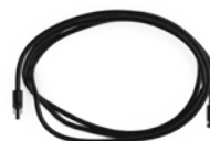
DC Extension Cable