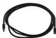
DC Extension Cable